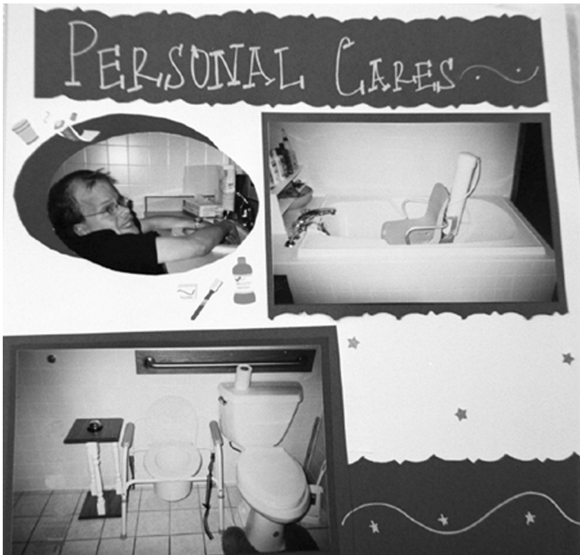
Figure 3.2. Pages from realistic job preview (RJP) scrapbooks. (Top page created by Marcie Grace.)