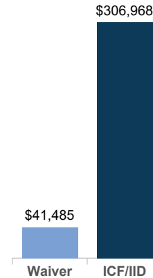
Figure 2: Medicaid Spending Per Person FY 2016